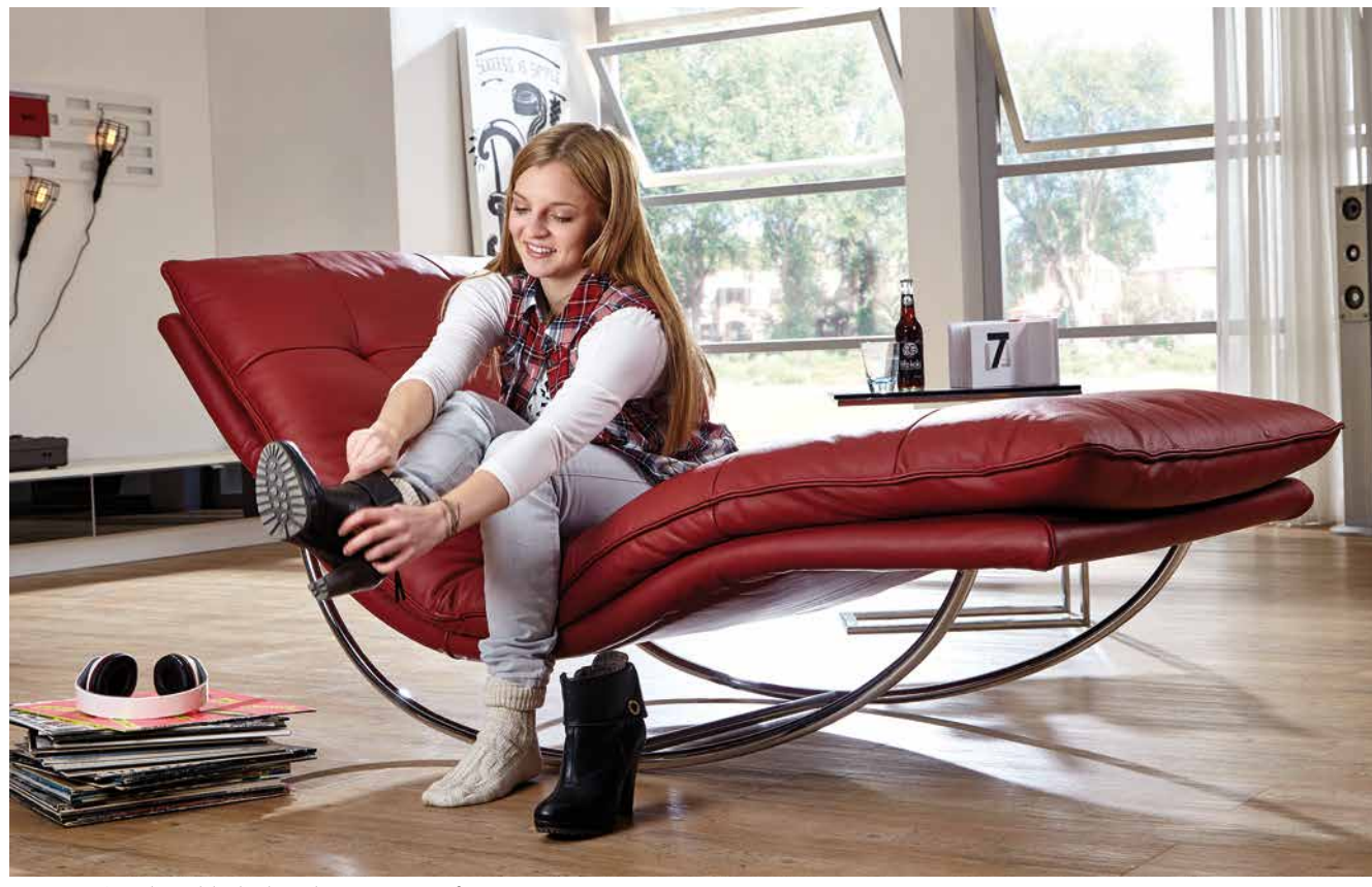
Cover: Z73/11 ruby red, high-gloss chrome swinging frame B1